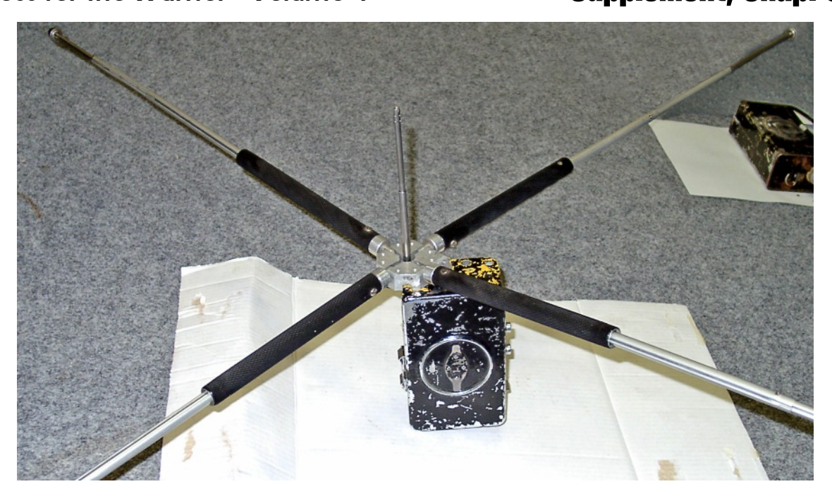
'AN/URC-4' Country of origin: USA